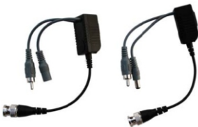
B-300 Video Balun Kit