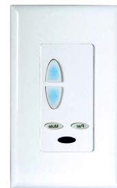
Optional IR & Button Controller model: A0129